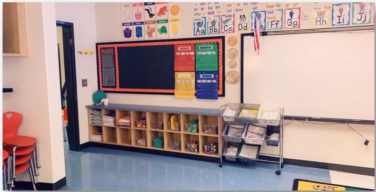
Front of the Classroom