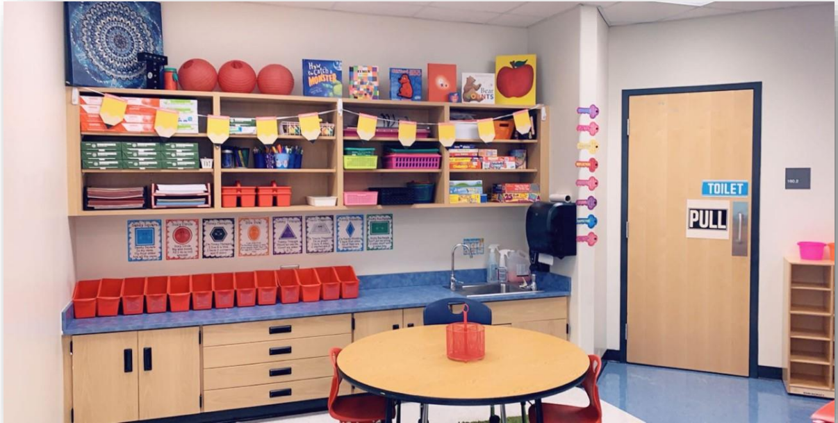
Back of the Classroom